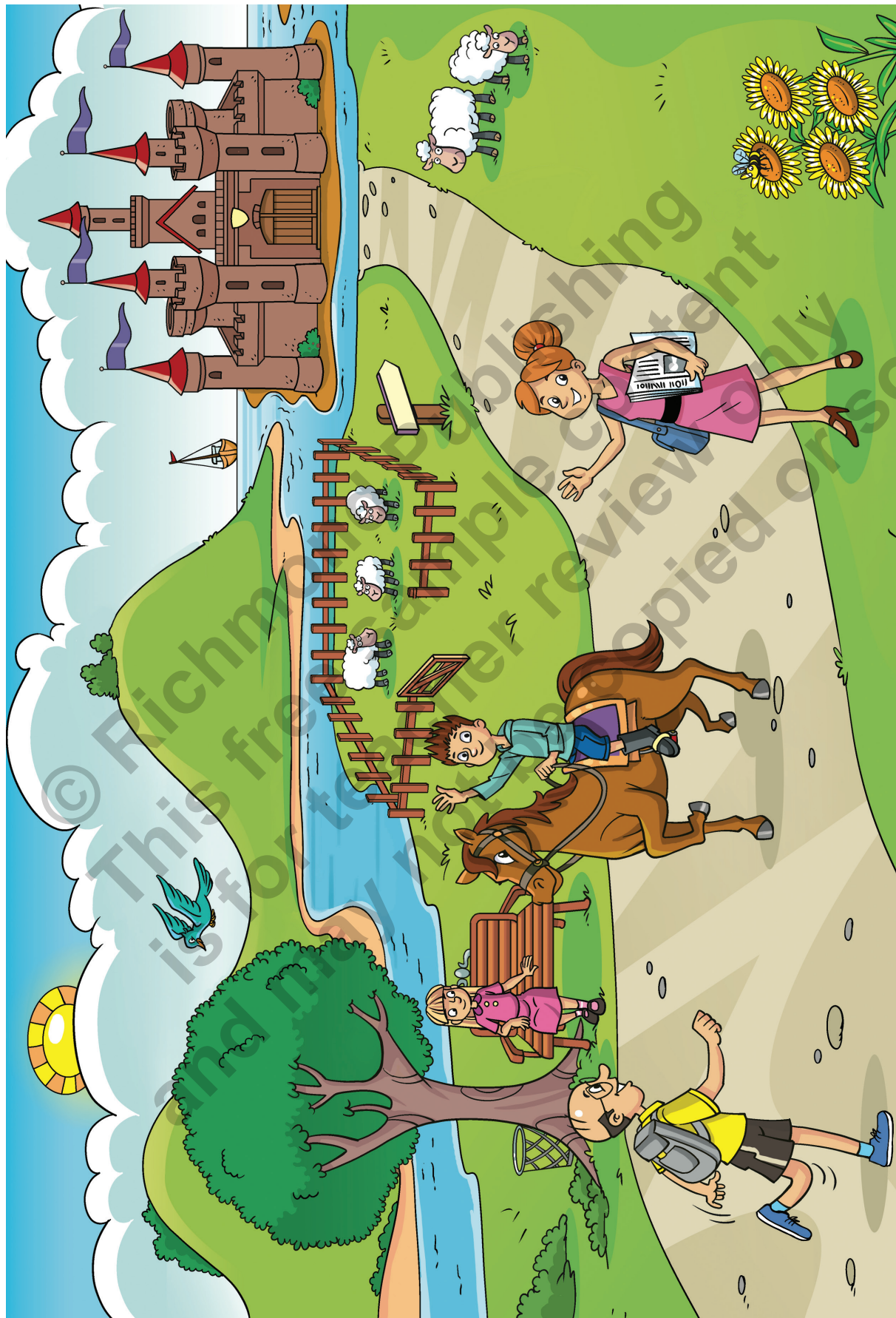
A2 FLYERS SPEAKING Find the differences