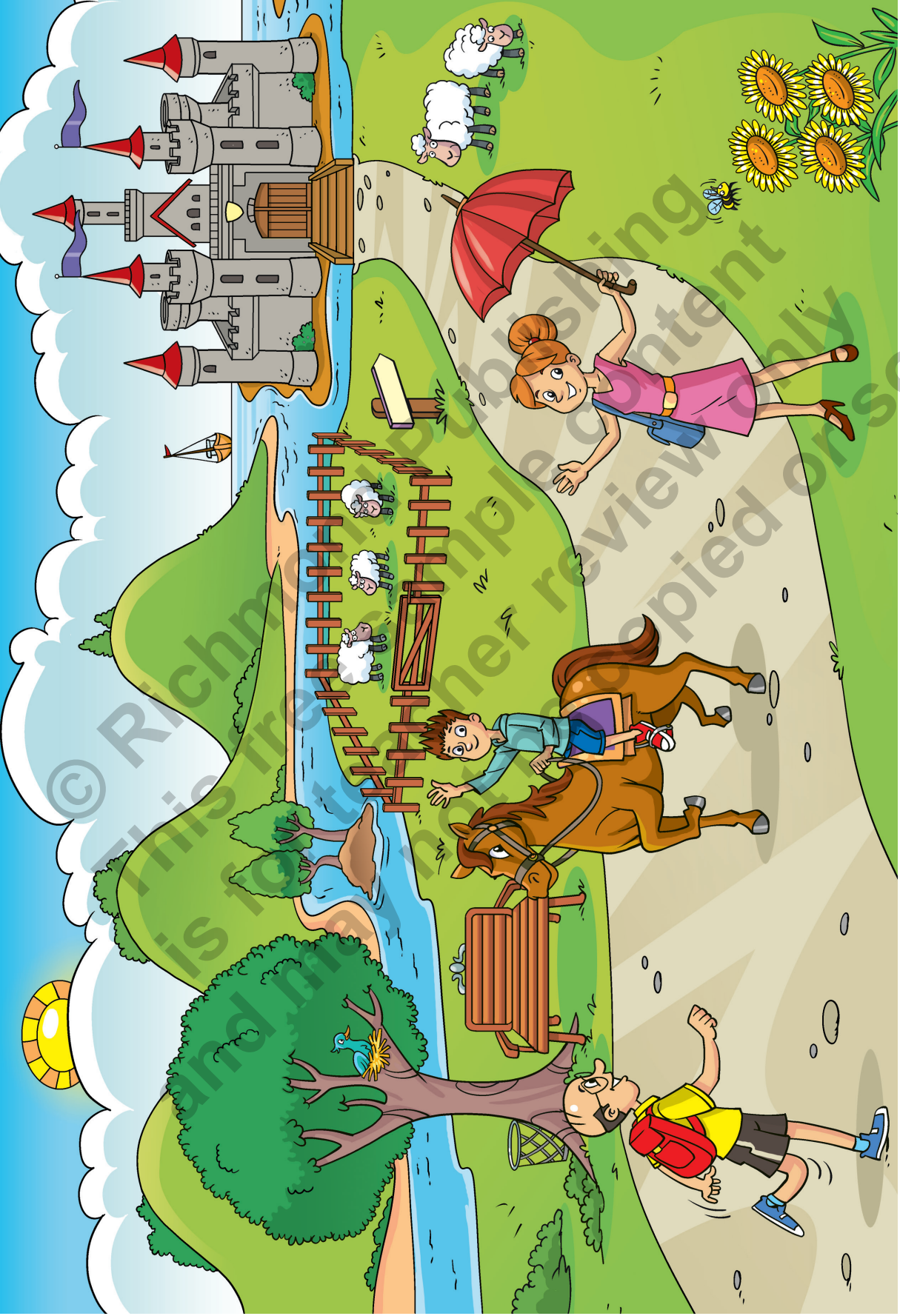
A2 FLYERS SPEAKING Find the differences